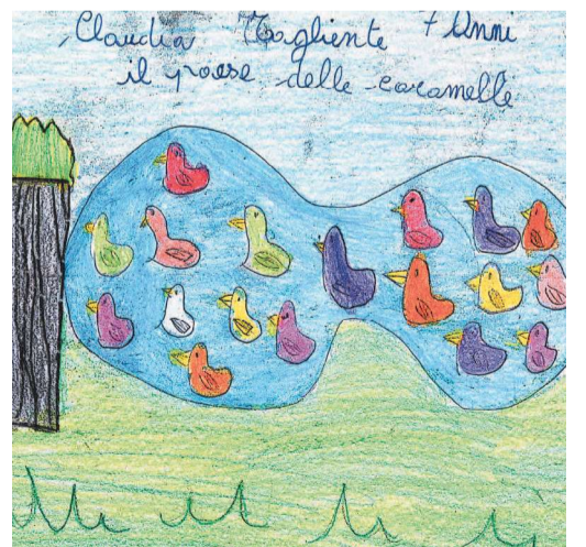
HOW WOULD YOU LIKE TO SEE YOUR CITY?

It's like playing grown-ups when you're little. (from the film "Last Tango in Paris" by Bernardo Bertolucci - 1972)