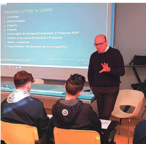
TRAINING COMES FIRST