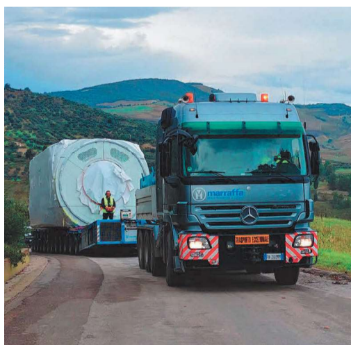
THE MOUNTAINS ARE BEAUTIFUL, BUT SO MUCH WORK...