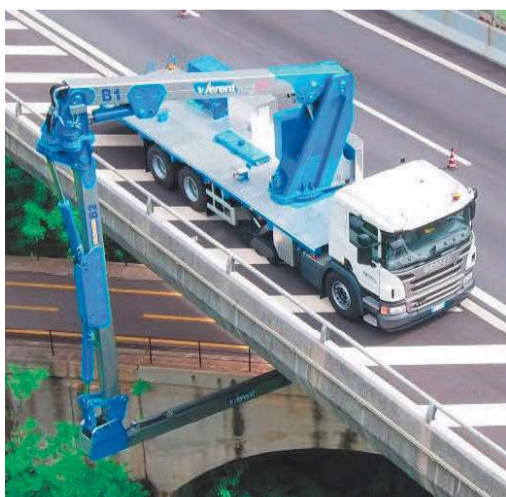
A VEHICLE THAT IS UNIQUE IN ITALY